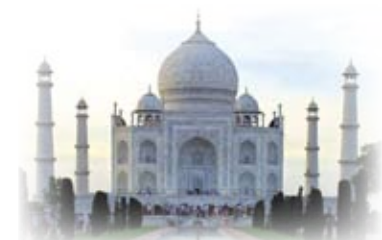
ERTMS will soon connect New Dehli and Agra, a city adjacent to the Taj Mahal

Yes, ERTMS is already in service in a large number of projects outside Europe. In particular, major parts of the Taiwanese (1200km of tracks equipped with ERTMS) and South Korean (1500km) networks are operating with ERTMS. In India, the Chennai-Gummidipundi line is in service, and a second line (Delhi-Agra, leading to the Taj Mahal!) is scheduled for commercial operations in 2009. The Cuautitlan – Buenavista line (70km) near Mexico is also running using ERTMS.